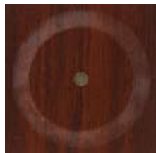
400 cycle sample for WRM