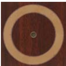
400 cycle sample for HPL*

Please request samples prior to specifying.